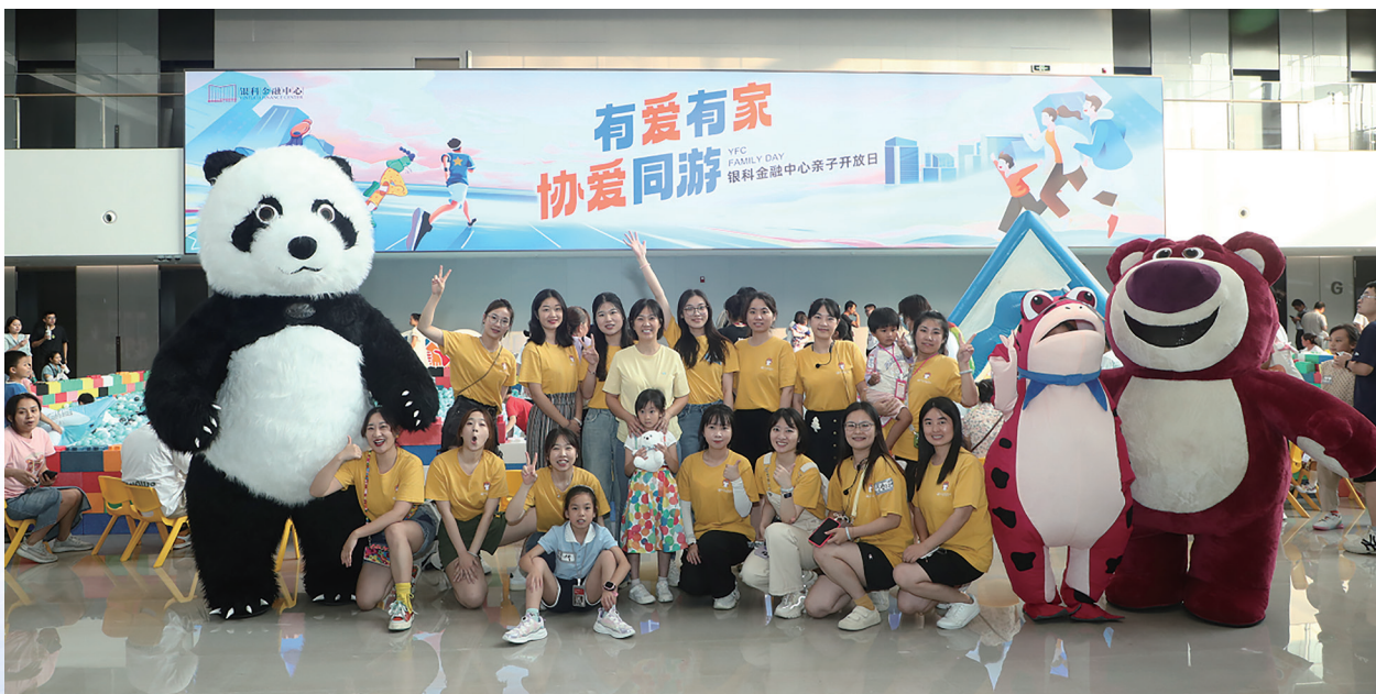
JF Wealth Family Day 九方財富親子開放日

本集團重視僱員幸福感提升，積極組織多樣化的活動以豐富僱員的精神文化及物質生活。我們每年舉辦周年文化周、年會以及節假日活動，增強團隊凝聚力，形成了僱員以團隊為大家庭的文化氛圍。本集團開設羽毛球社、電子競技社、風火輪滑社、足球社、公益社等14個僱員活動社團，希望僱員可以實現工作與生活的平衡，達到快樂工作、快樂生活的狀態。本年度，本集團組織了以下團建活動：