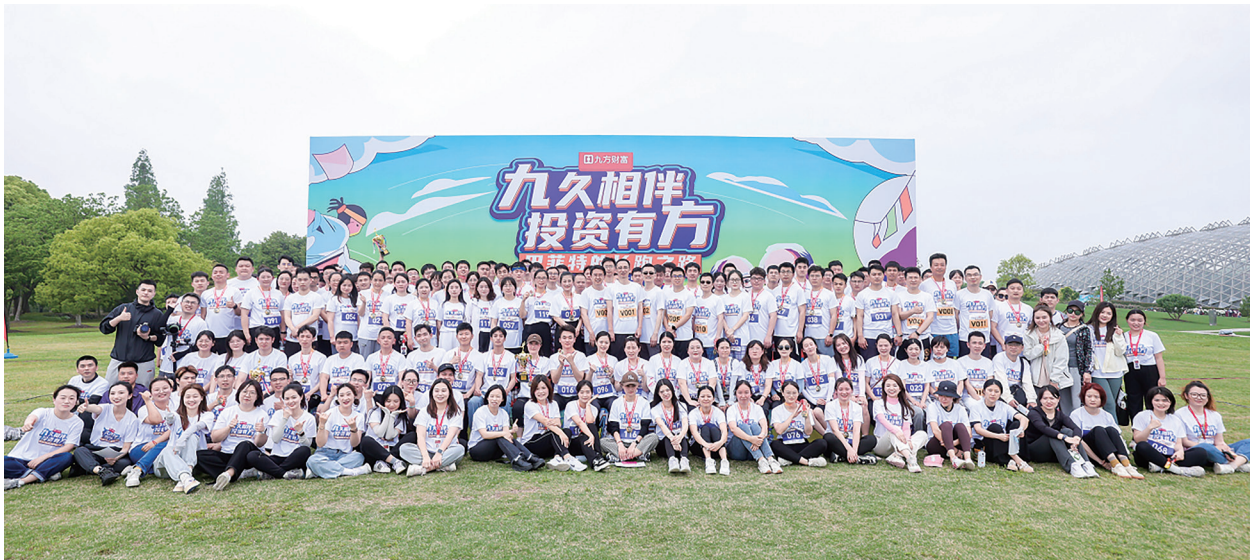
“Warren Buffett Long Distance Run” Event Held by JF Wealth 九方財富舉辦“巴菲特長跑之路”活動