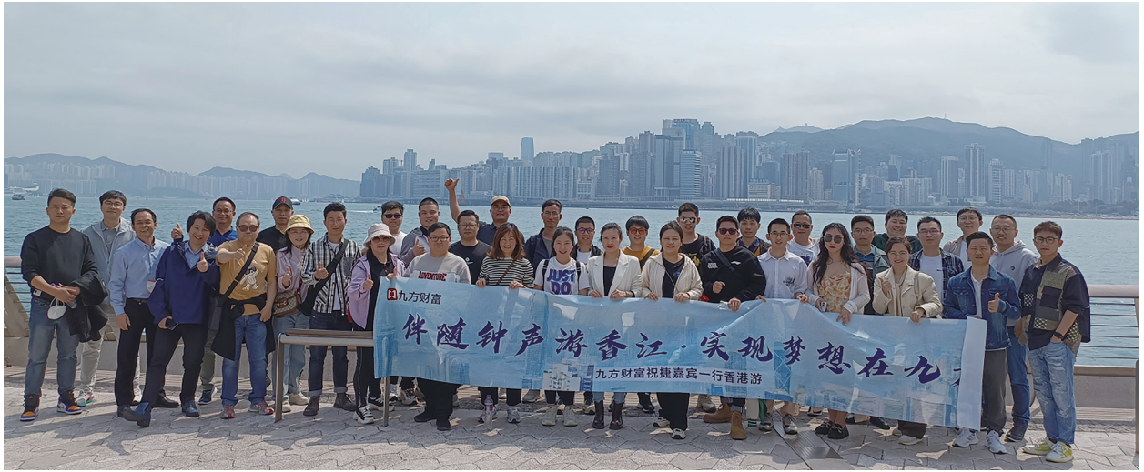
JF Wealth Hong Kong Trip In Celebration of Company Listing 九方财富香港上市遊