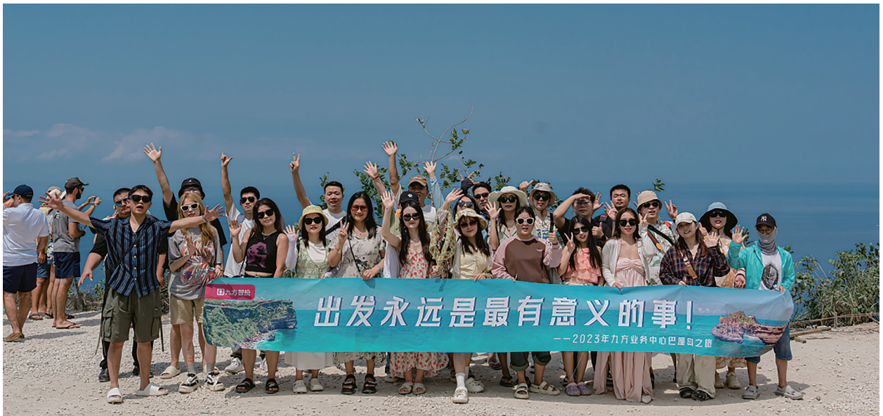
JF Wealth Business Center Bali Trip 九方财富業務中心巴厘島之旅